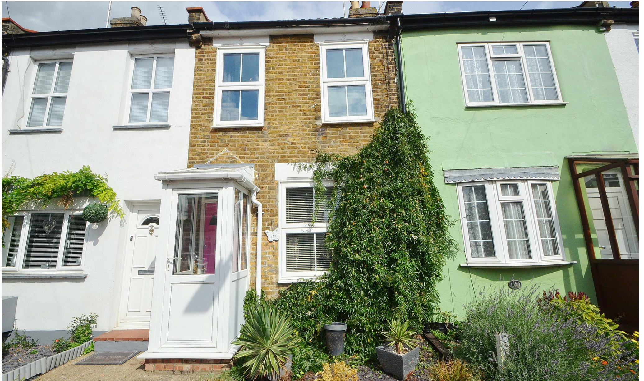
Armitage Road, Thorpe Bay £1,395 PCM